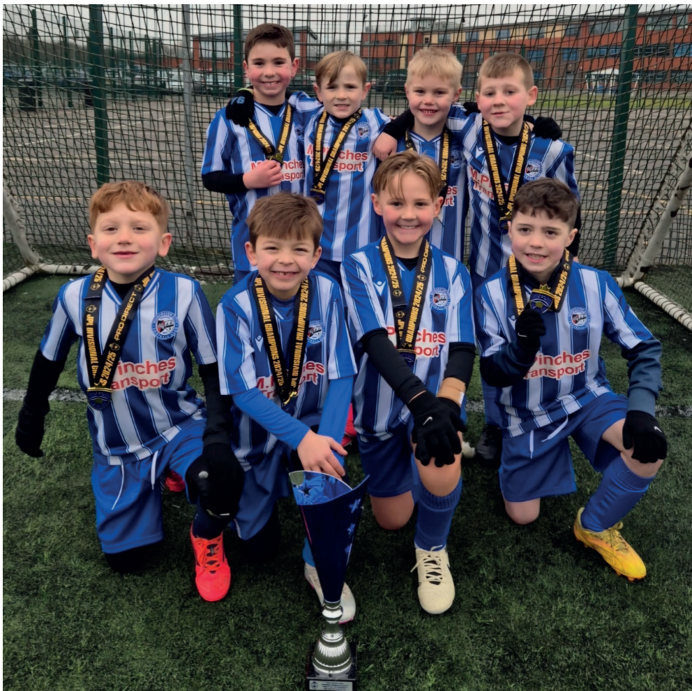
Worcester City will be celebrating and showcasing their thriving youth development section on Saturday

Finally, AFC Sudbury host Stratford Town and Bromsgrove Sporting head to Barwell with all four clubs looking to pull themselves away from the lower reaches of the table.