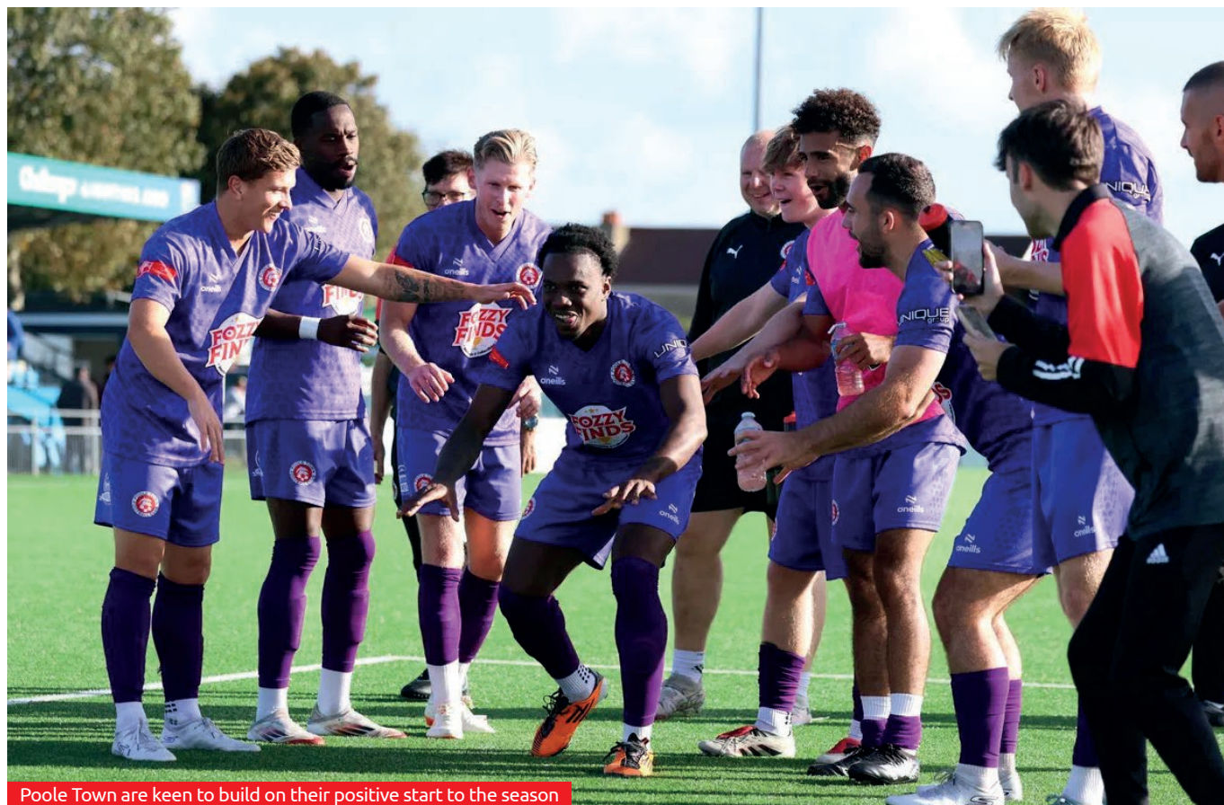
Poole Town are keen to build on their positive start to the season

Just a point separates Basingstoke Town and Havant & Waterlooville as they go head-to-head to complete the weekend action.