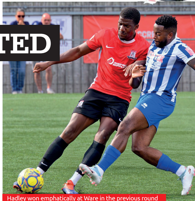
Hadley won emphatically at Ware in the previous round

"But it's about what we do and we'll be looking to continue the positives from our last game and get the job done so that we're in the draw for the next round.